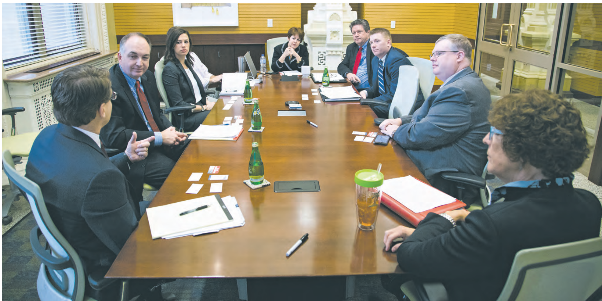
TABLE OF EXPERTS INNOVATIONS IN HEALTH CARE

What are current trends in health care design and construction? What's driving it, and how is it impacting costs?